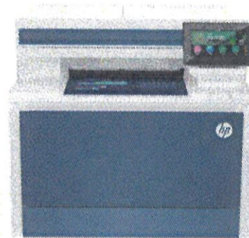
HP Color LaserJet Pro MFP 4301fdn Printer

This printer is intended to work only with cartridges that have a new or reused HP chip, and it uses dynamic security measures to block cartridges using a non-HP chip. Periodic firmware updates will maintain the effectiveness of these measures and block cartridges that previously worked. A reused HP chip enables the use of reused, remanufactured, and refilled cartridges. More at: